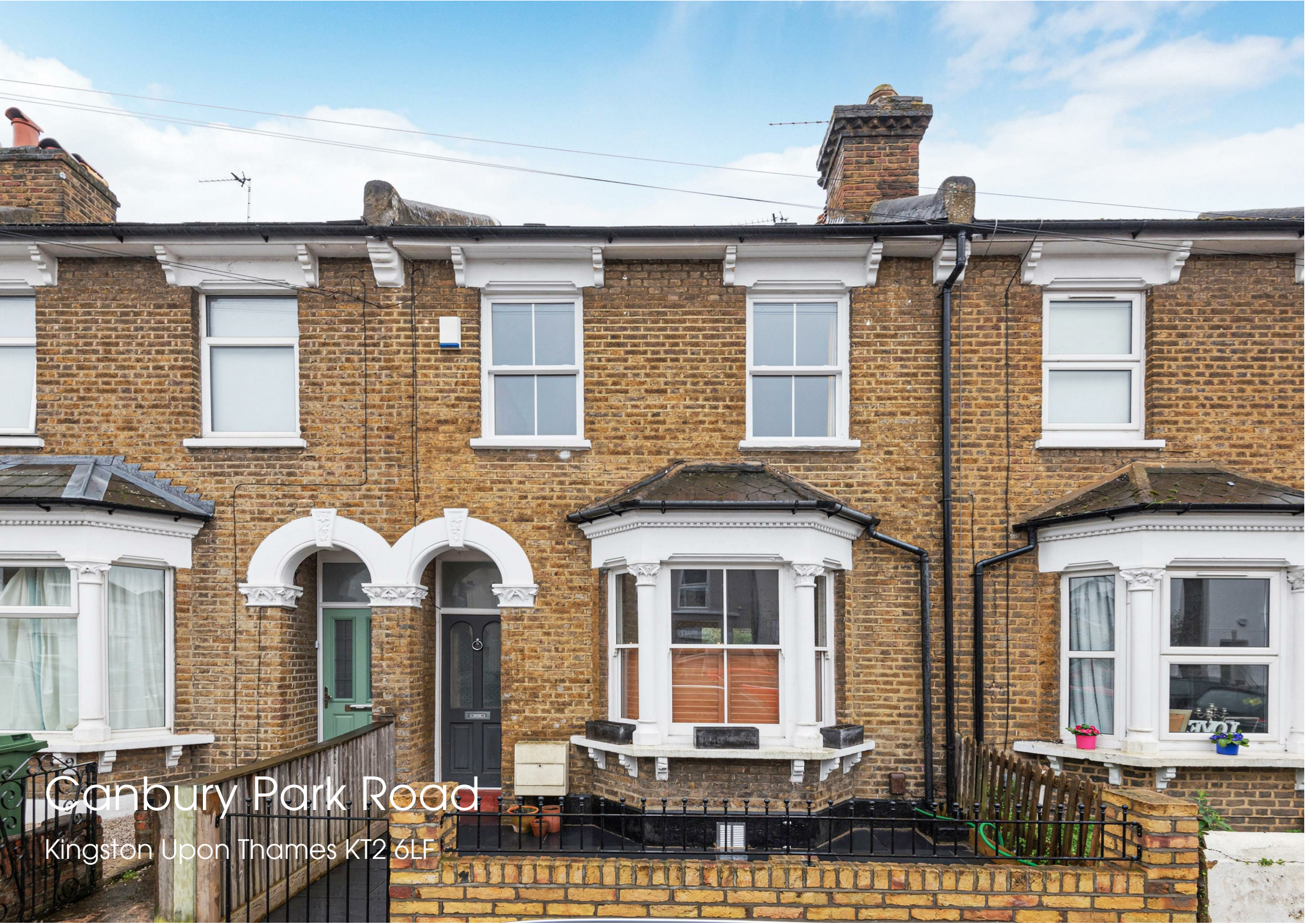
Canbury Park Road Kingston Upon Thames KT2 6LF